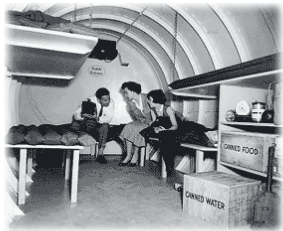
Sample shelter in Long Island

The world is different now. Russia is smaller and arguably weaker than the Soviet Union [ Russia has been formed by the association of